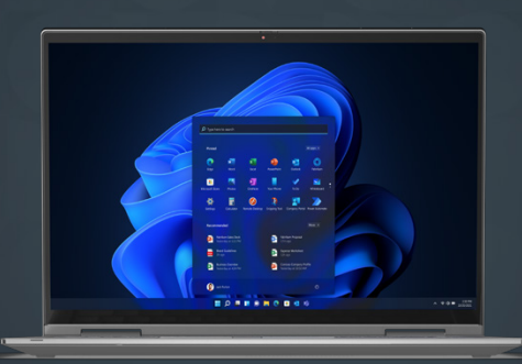
ThinkPad X1 Yoga

Equip your employees with modern devices that empower today's flexible work. Our solutions layer features and services on Windows 11 devices to meet your most pressing IT challenges.