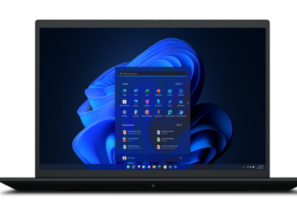
ThinkPad P1 Mobile Workstation

Flexibility and power in a range of ever-smaller form factors